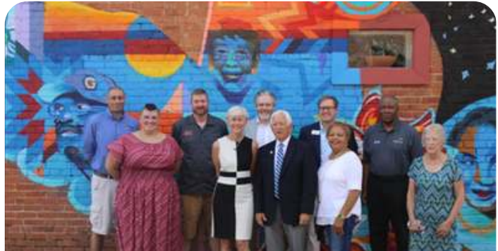
LUMBERTON 11:00 75° SPECTRUM NEWS 10 GARNER GETS $1M FOR DOWNTOWN RENOVATION