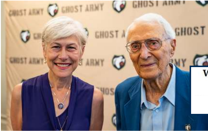
WWII 'Ghost Army' was a secret for 51 years. NC vet now being honored for his role. The News&Observer