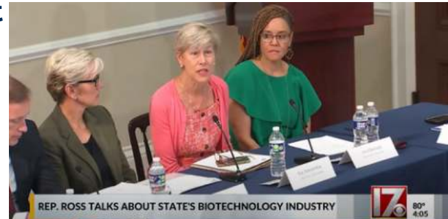
REP. ROSS TALKS ABOUT STATE'S BIOTECHNOLOGY INDUSTRY