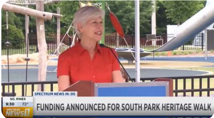
FUNDING ANNOUNCED FOR SOUTH PARK HERITAGE WALK