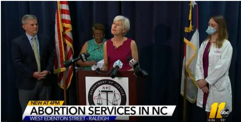
NEW AT 4PM ABORTION SERVICES IN NC WEST EDENTON STREET - RALEIGH